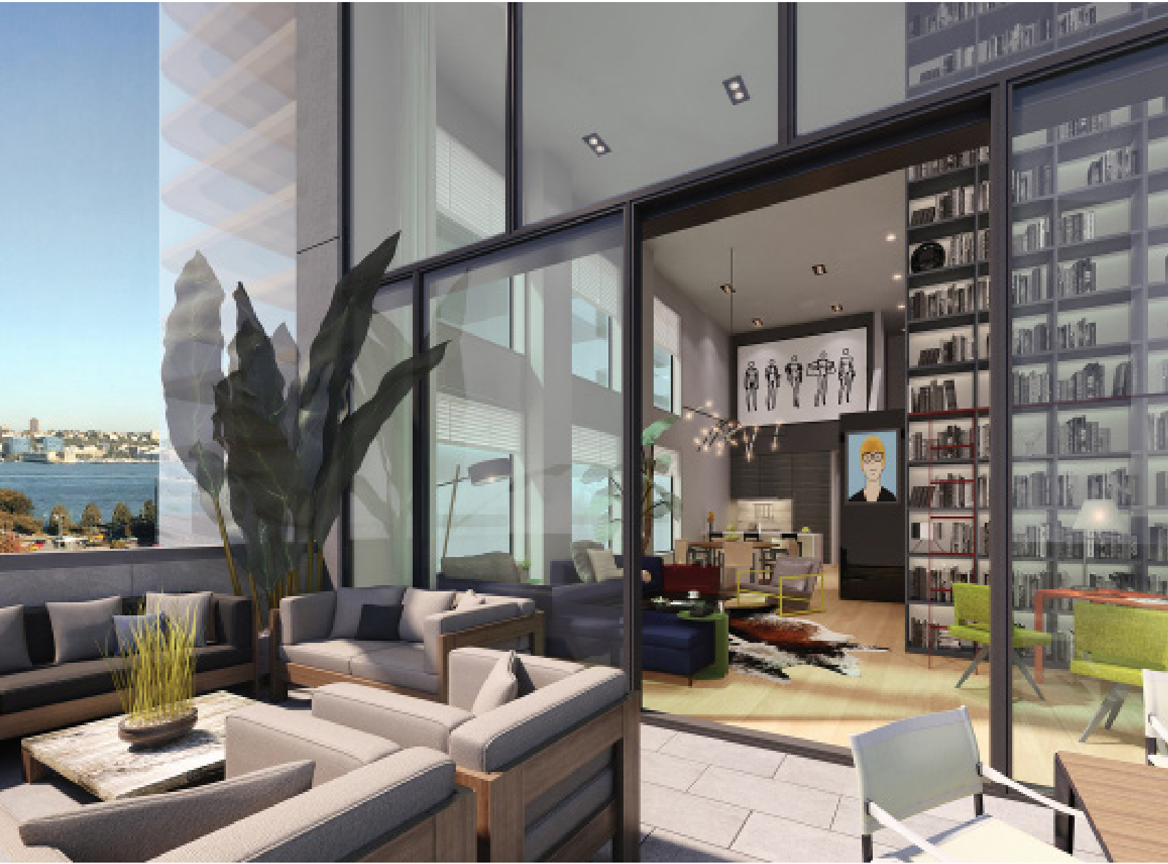
View from Penthouse Terrace